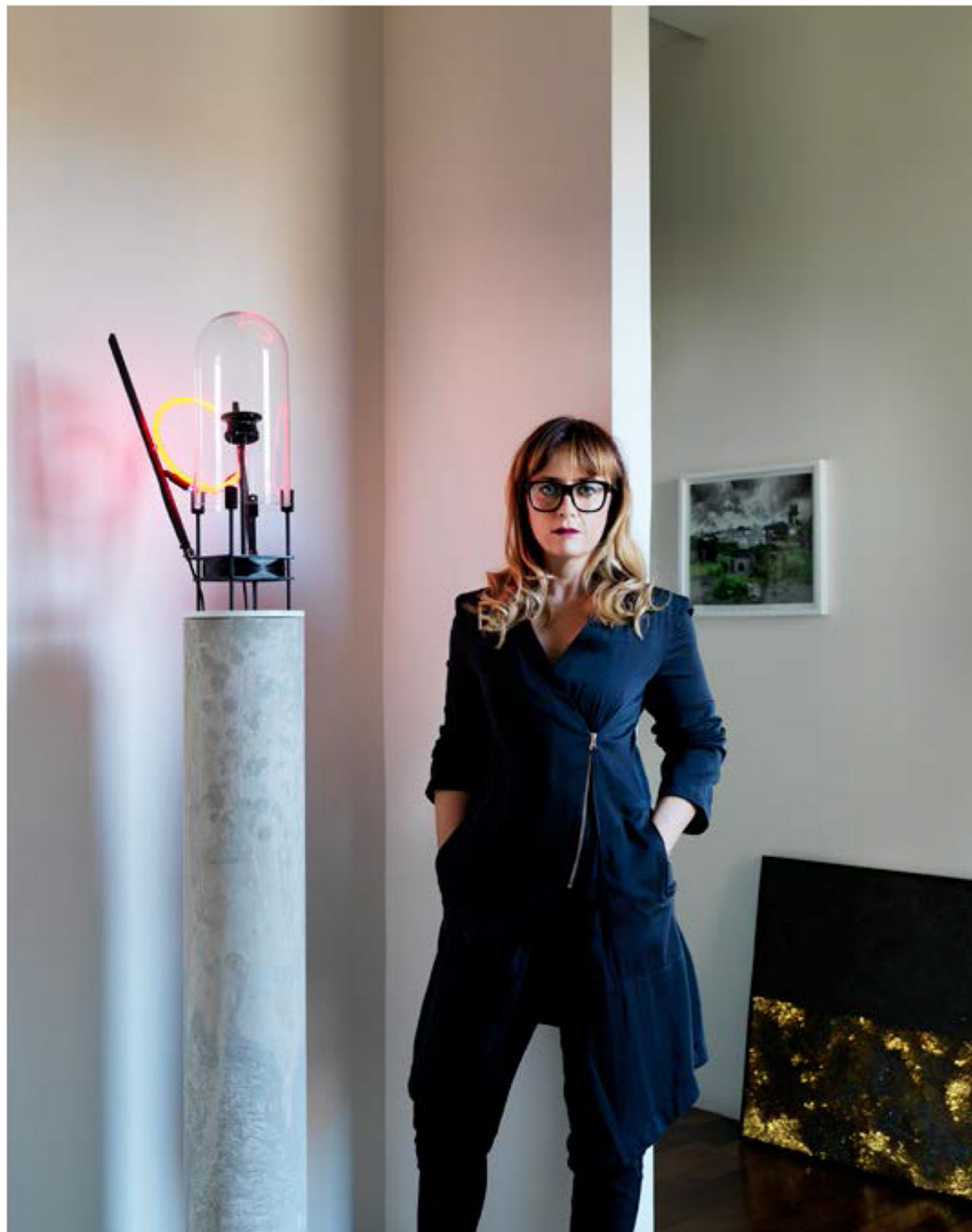
Art Director, Visionnaire